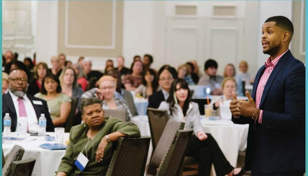
MassHousing's 2017 Community Services Conference "Crisis to Calm: Collaborating to Support Residents' Mental Health in a Safe Environment" addressed mental health issues in housing.